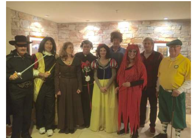
-HMAA Annual "Scared Straight" Halloween party brings fun and frights to HRC!