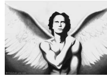
Strength through Surrender