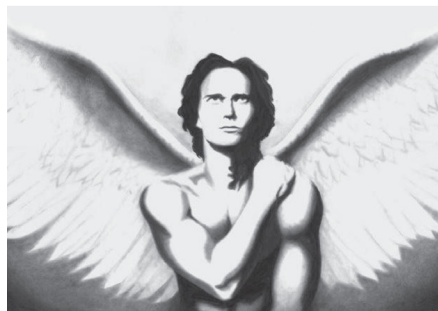
Strength Through Surrender in Recovery