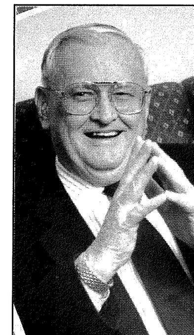
"The Iron Marshmallow"